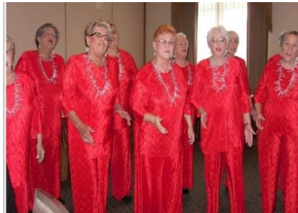
The "Sweet Adelines"