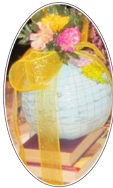
Centerpieces created by Gloria Cantu and the ASJP Table members.