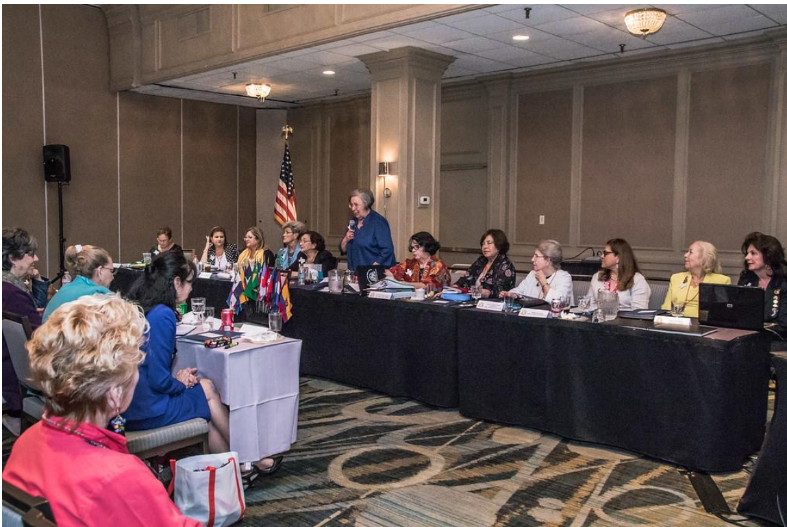
PARTT State Director closed the First Business Session.