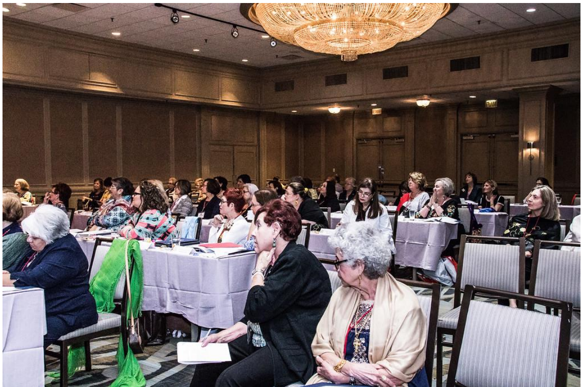
Convention Delegates and Attendees were patient during the long meeting.