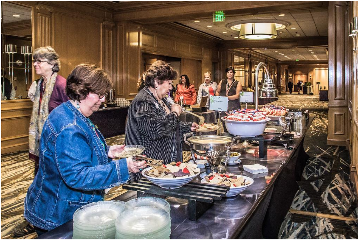
There was a lunch break as well as an afternoon Merienda.