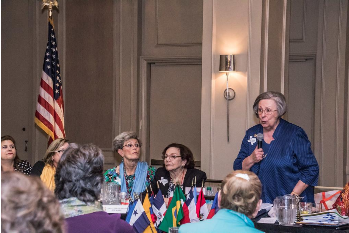
PARTT State Director opened the meeting with collect, Pan American Pledge, National Anthem, the Star Spangled Banner, and the Chilean Anthem.