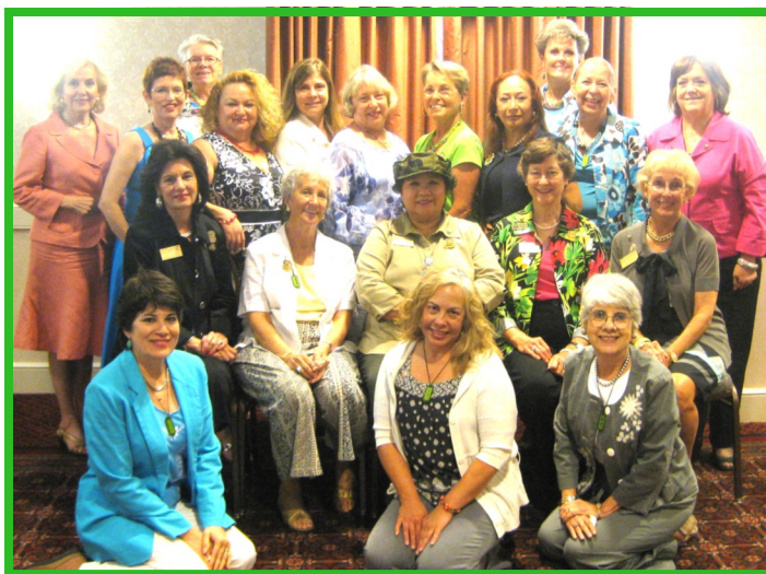
San Antonio Workshop • La Quinta Convention Center • August 29, 2009