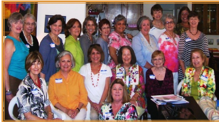
Table Directors, Alliance Dignitaries and State Officers