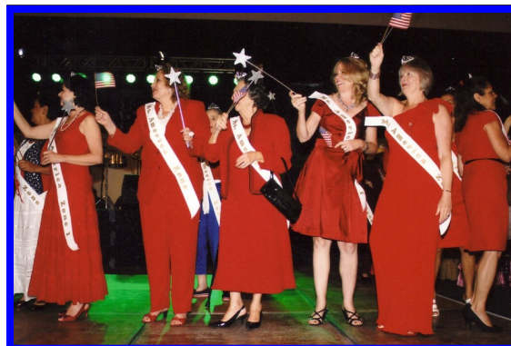
"Pan American Night " during Alliance Convention .