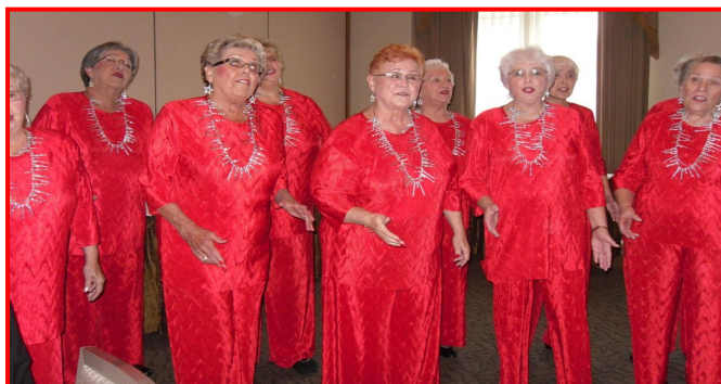
"The Sweet Adelines"

ficking and its Effects on Women and Children involved". The Sweet Adelines were again on hand to prepare for the coming Christmas season, with their very enjoyable Christmas Carol renditions.