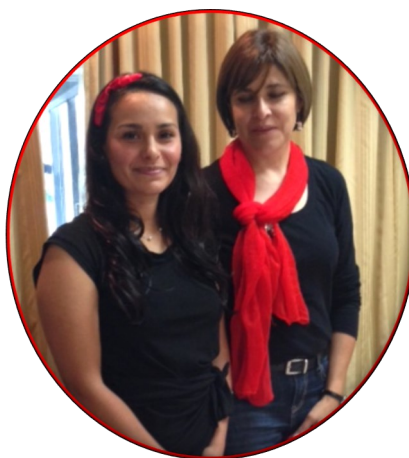
Two deserving young ladies who were awarded scholarships in May,

In May, 2014 scholarships were awarded to two deserving scholars, while the Christmas season brought an opportunity to hold a “Holiday Home Tour” as a fund-raiser to support the scholarship fund.