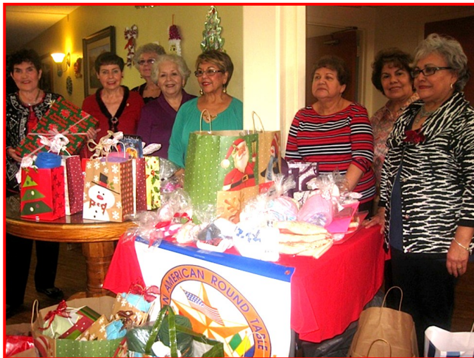
Table Members Donate Gifts to 200 Nursing Home Residents in December