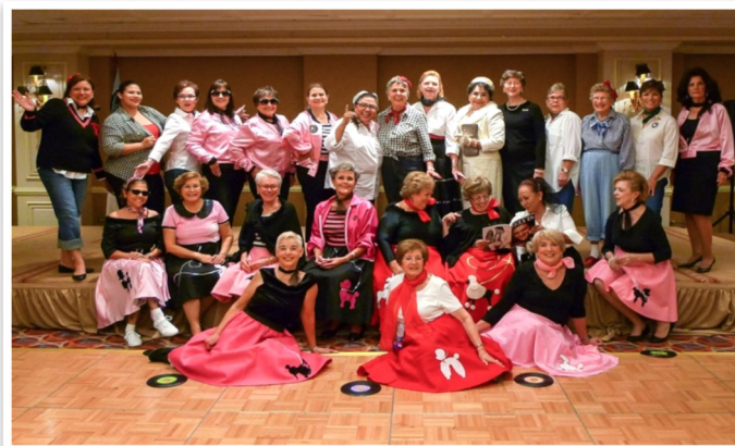
Attendees from Zone I dressed in 50s outfits