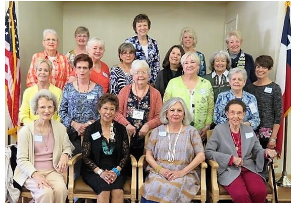
Conroe Table celebrate Pan American Day at their April meeting