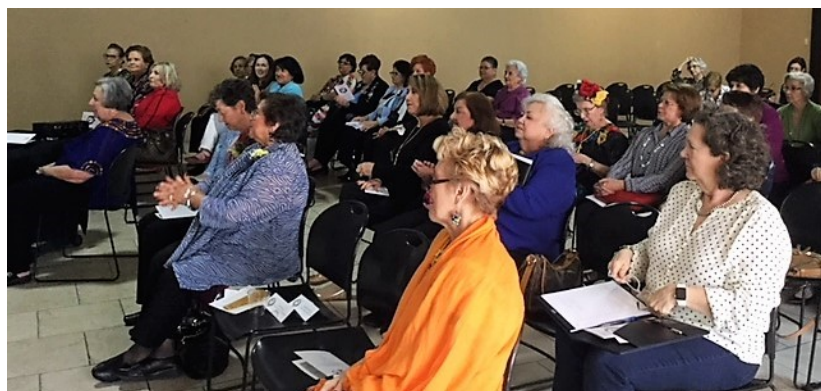
Ladies in attendance at the Alliance "Leadership" meeting .